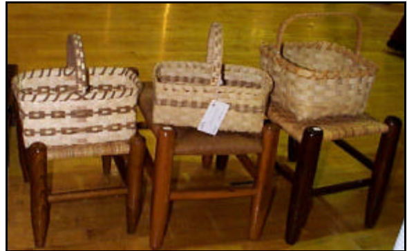
Baskets displayed at a craft fair in Blacksburg, Virginia. November 2000.

rim to the handle and also ties the smaller ribs as they are added to the basket body.