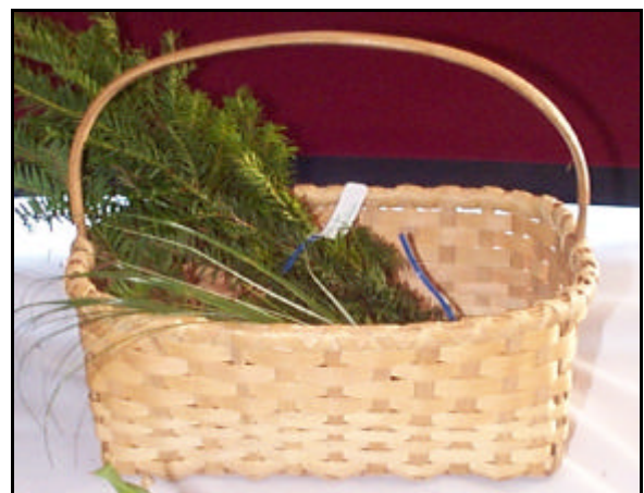
Split oak basket from Southern Appalachia

Splints are then separated by starting them with a knife, following the growth rings and tearing or pulling them apart with the hands. The process is continued by dividing each section of the strip by halves until the splints are reduced to the required thinness or until they reach the width of a single annual ring. Torn (rived) splints are stronger and more flexible than those sliced off with a tool because they are made up of long, continuous fibers which make up the grain of the wood.