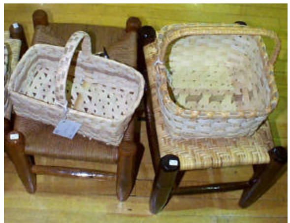
Baskets displayed at a craft fair in Blacksburg, Virginia. November 2000.

The topmost weaver in the basket is trimmed at a gradual slope for several inches to allow it to meet the spiral without creating an abrupt, uneven step in height. A freshly woven basket must be allowed to dry out for at least a couple of days before completing the top border. The splints invariably shrink in the process of drying and, as a result, the weaving becomes loose. After the basket is dried, the weavers are packed down on the stakes until they are tight.