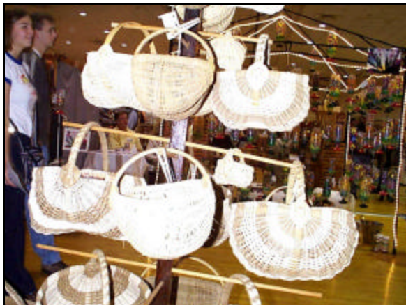
Baskets displayed at a craft fair in Blacksburg, Virginia. November 2000.

Each region of the United States has its own market for weaving and basketry material. The supply houses buy and sell basketry and other weaving materials. Most people purchase their materials from these supply houses. There are a few wholesale buyers who buy and sell basketry materials. They primarily use catalogs for enhancing their business. Some of them conduct their business through retail stores.